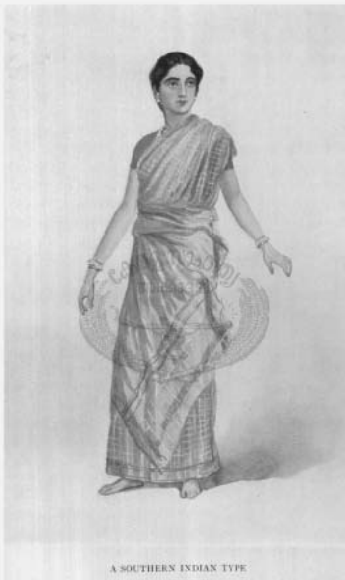
A SOUTHERN INDIAN TYPE